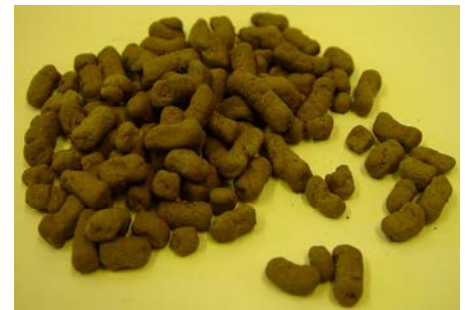
Figure 4. Sustainable aggregate produced from waste silt and fines.

Aggregates were subjected to an increasing compressive load and the deflection after each load increase was measured. The amount of fines generated was determined at the end of the test. The results demonstrated that trial aggregates were stronger than commercially available lightweight aggregate. Deflection and fines generation were comparable to those obtained from aggregate produced from existing washing plant, indicating potential viability for use in a range of applications such as trench backfill and sub-base.