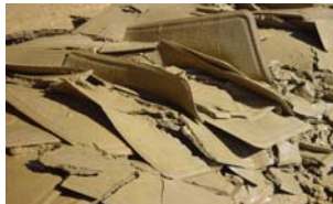
Figure 2. The waste silt generated from aggregate washing is separated from the wash-water by filter press. This is generally sent to landfill.