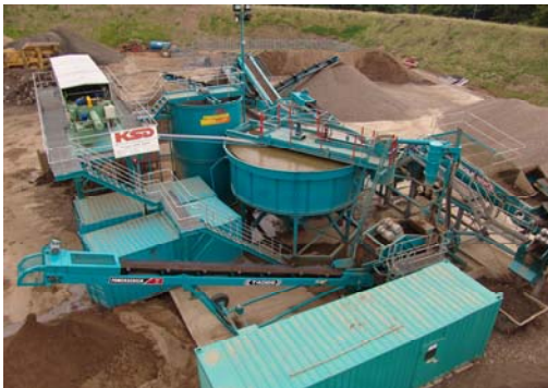
Figure 1. Aggregate washing plant in operation. Coarse aggregates and sand can be separated out and sold.

Silts have previously been converted into products by high temperature sintering. The energy costs and environmental issues associated with sintering mean this research aims to develop ambient temperature processes. Following full characterisation of waste silts and fines the research is investigating innovative processing using cementitious binders and polymer additives to produce aggregate materials.